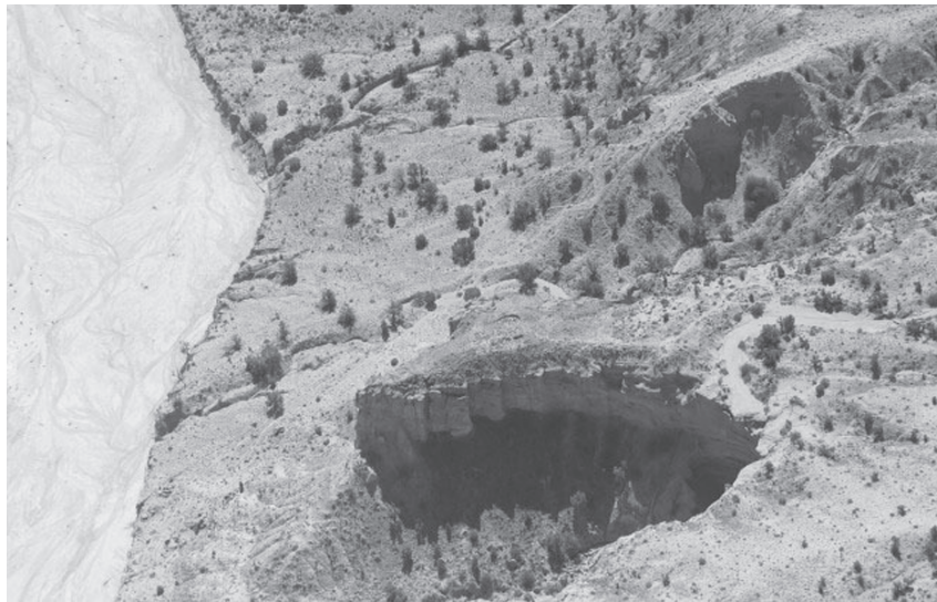
Figure 1.2. An aerial view of Twin Angels Pueblo, a small Chacoan great house. The site is in the middle of the photograph, on the edge of a steep cliff that drops into a large rock shelter. The main portion of the Great North Road ends just south of the site.

Valley. Although he has walked for two days, the traveler immediately feels comfortable in this new setting. Salmon has been built in the classic Chacoan style, with massive walls and a towering three-story layout that together recall Pueblo Bonito and other monumental buildings at the man's home in Chaco Canyon (fig. 1.3).