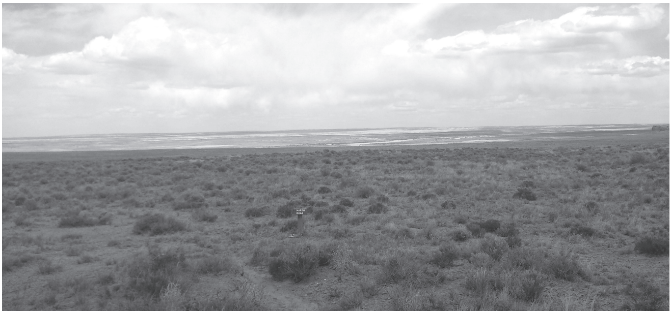
Figure 1.1. A view looking north along the Great North Road from the Chacoan great house at Pueblo Alto. The Great North Road begins at Pueblo Alto and runs approximately thirty-five miles north to the vicinity of Twin Angels Pueblo.

The year is 1100 CE, and our traveler gazes upon a bustling town, known today as Salmon Pueblo, after the family that homesteaded this part of the fertile San Juan