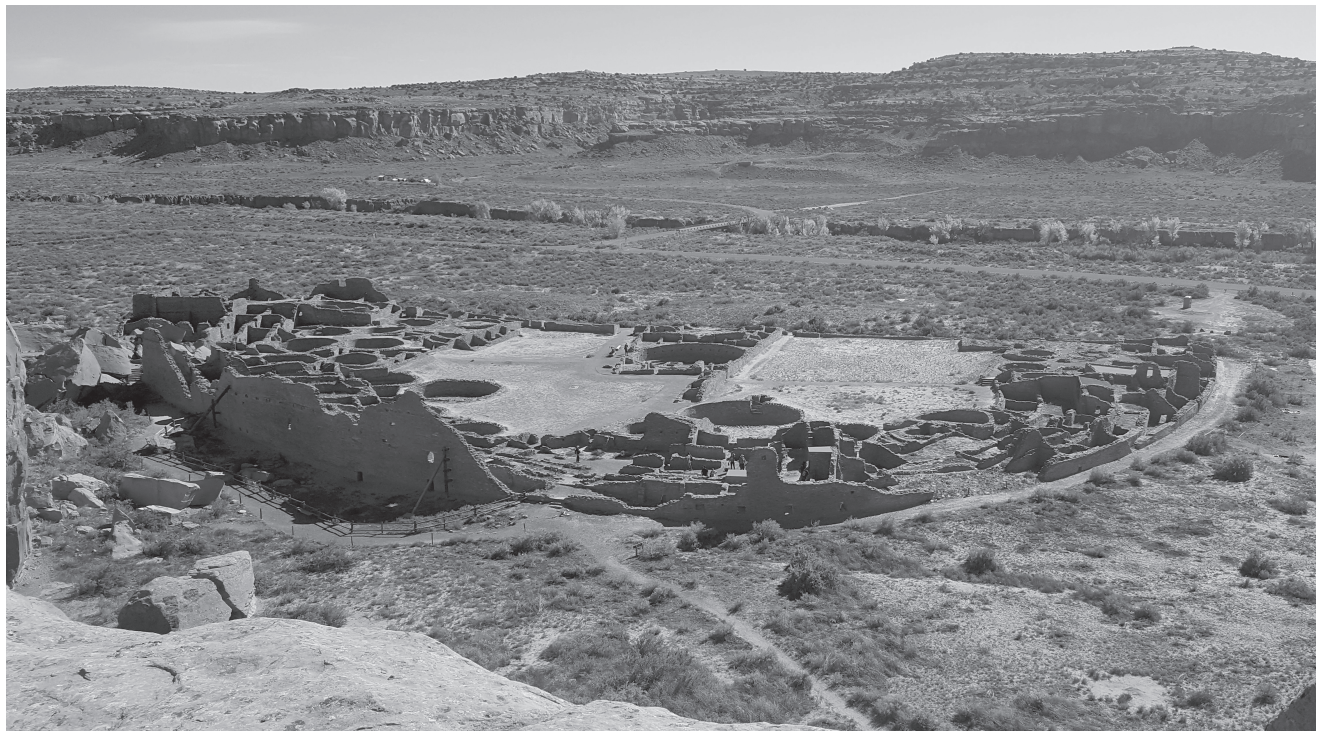
Figure 1.3. Pueblo Bonito, Chaco's greatest great house, from the overlook point. Readers will note Bonito's towering back wall and massive footprint on the south side of Chaco Canyon. It truly is monumental architecture.

A dozen years later, our traveler leaves Salmon Pueblo, heading north toward the next major river that runs through the Animas Valley. After an easy day's walk, he sees the sprawling community where a huge building is rising from the valley bottom. A smaller yet imposing pueblo sits on the mesa above it, with a road like the one